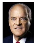
Henry Kravis KKR