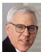
David Rubenstein The Carlyle Group