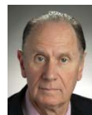
David Bonderman TPG

The World's Largest Private Equity & Venture Capital Conference