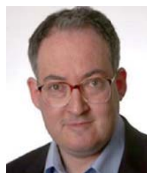
Gideon Rachman Financial Times