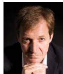
Alastair Campbell, Former Communications Strategist for Prime Minister Tony Blair