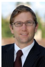
Lucerne University of Applied Sciences and Arts HOCHSCHULE LUZERN Wirtschaft Institut für Finanzdienstleistungen Zug IFZ