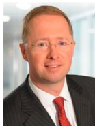
Paros Capital AG